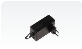
48 V 0.95 A power adapter